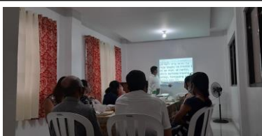
Teaching on importance of scriptural baptism, Magalang MBC