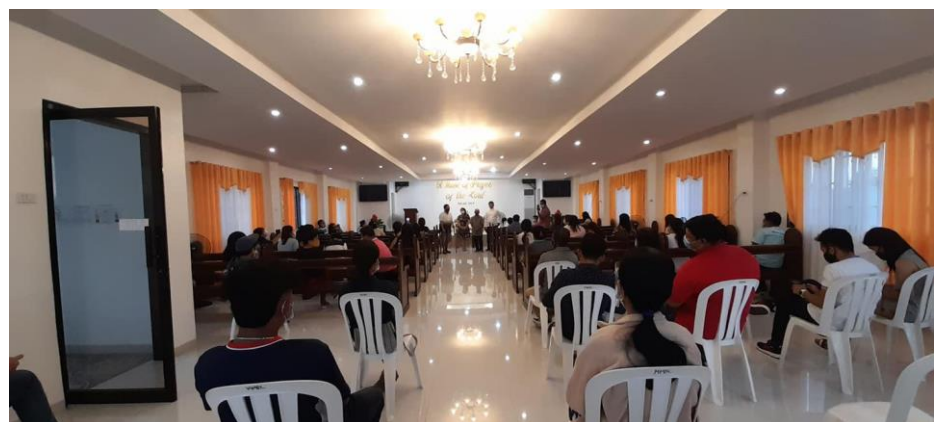
Magalang MBC, Project #12 in one of their recent Services